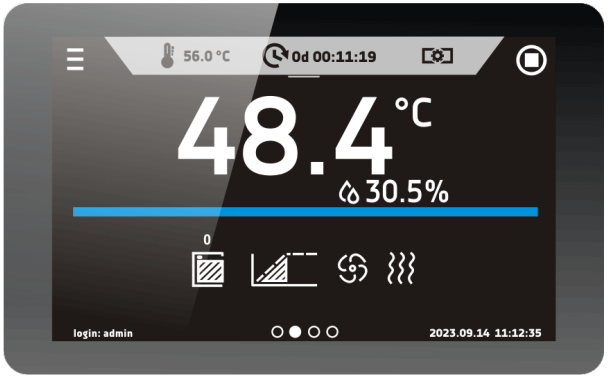
Smart PRO - preview screen